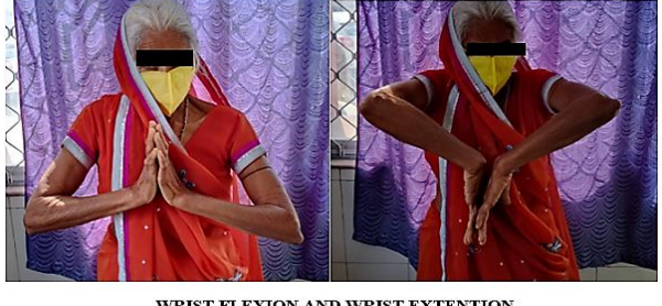
WRIST FLEXION AND WRIST EXTENTION Figure 4. Functional outcome of titanium nailing in forearm fracture (Case 1)