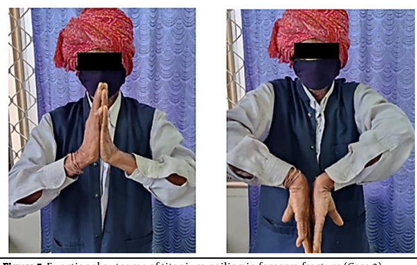
Figure 5. Functional outcome of titanium nailing in forearm fracture (Case 2)

Open reduction and internal fixation (ORIF) with plating is usually advised for displaced diaphyseal fractures in adults because of the inherent property of fracture displacement by powerful muscles. In contrast to adults, elderly forearm muscles are weaker; thus, it becomes easier to maintain fracture reduction. Malunion and nonunion occur less frequently with titanium nailing in elderly patients.