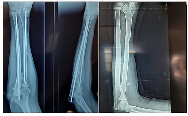
XRAY AFTER UNION AND POST IMPLANT REMOVAL XRAY Figure 2. Radiological outcome of titanium elastic nailing (TEN) in elderly forearm fracture (Case 1)

Out of 25 cases, only one (4%) presented with superficial infection at the entry site. One patient presented with extensor pollicis longus injury that recovered with time after the removal of the implant.