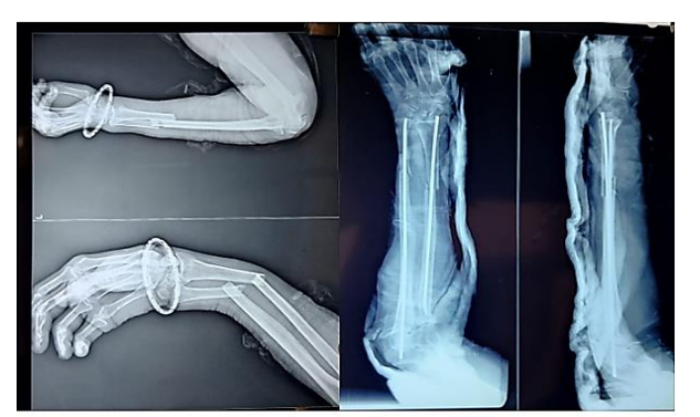
PRE-OP XRAY AND POST OP XRAY