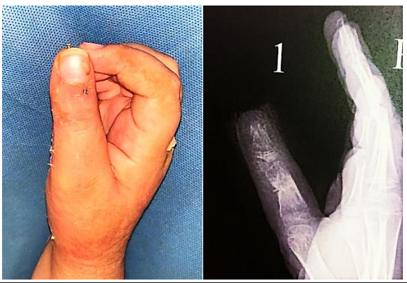
Figure 2. A. Corrected appearance in the right thumb; B. Early postoperative radiographic image of corrected right thumb deviation

Follow-Up: The patient was evaluated two weeks postsurgery through physical examination and radiography (Figure 2). In the fourth week, the K-wires were removed from the surgical site under digital block anesthesia, and the protection continued with a removable part-time splint for an additional two weeks. During subsequent follow-up, the patient was assessed through physical examination and radiographic imaging three months after the surgery.