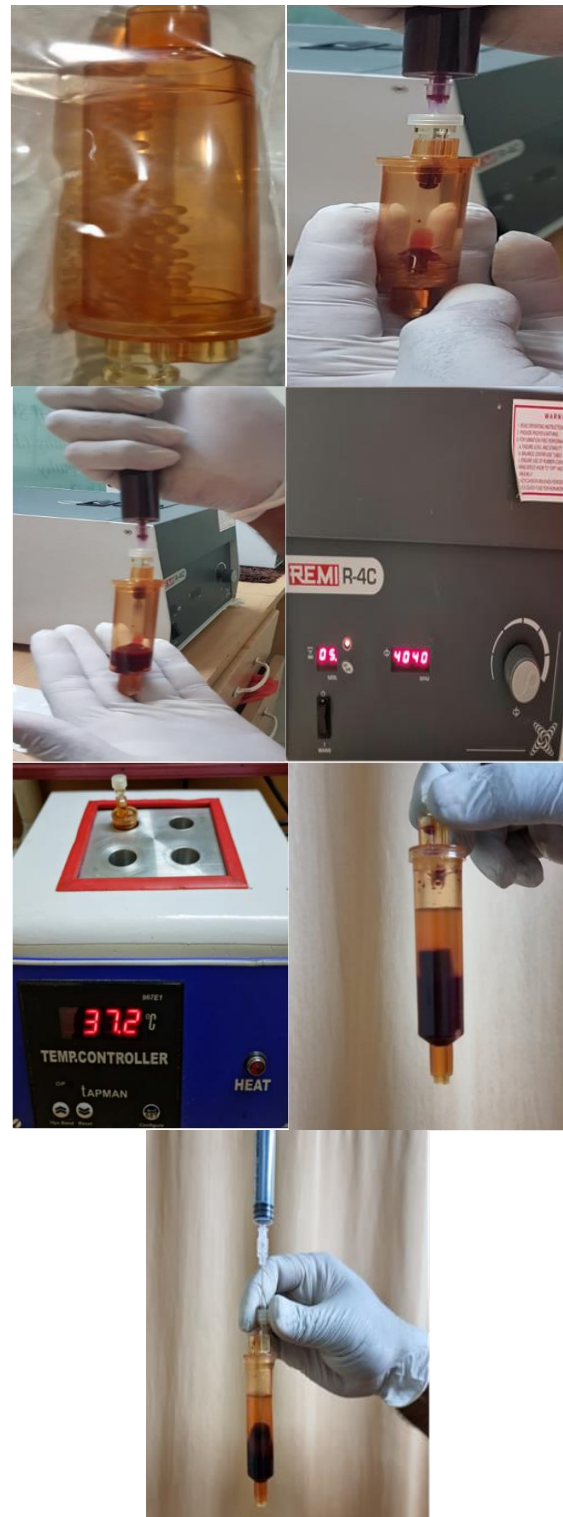
Figure 2. Steps of autologous conditioned cytokine-rich serum (ACRS) preparation