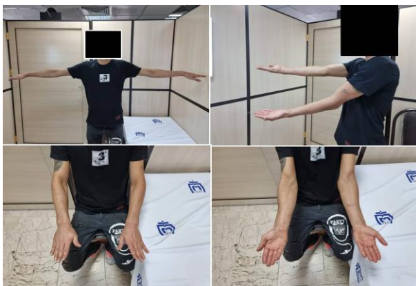
Figure 4. Patient elbow's full range of motion (ROM) in the follow-up session

The patient wore a splint for a week following the operation. From the second week, a bandage was placed on the elbow along with elastic bands. Passive movements began, followed by the active assisted and active movements. To prevent HO, indomethacin 25 mg three times daily was prescribed for him. At a two-month follow-up, the patient underwent ten sessions of physiotherapy to recover his weak muscles. After that, he returned to his job, and his elbow's ROM was completely recovered. MEPS was measured 100, representing an excellent outcome. No complications such as nonunion, infection, or joint stiffness were noticed (Figure 4).