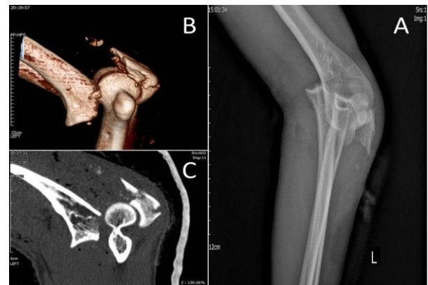
Figure 2. The patient fracture in different types of imaging; A: Radiograph, B: Three-dimensional computed tomography (3D CT) scan, C: Simple CT scan

A 29-year-old man was admitted to the emergency department with an open elbow fracture due to a motorcycle accident. Further evaluations revealed an anterior transolecranon fracture-dislocation accompanied by a laceration leading to rupture of the flexor carpi ulnaris (FCU) and ECU muscles (Figure 2). Neurological examinations and arterial pulses were normal.