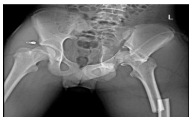
Figure 1. Preoperative anteroposterior (AP) radiograph of the pelvis

A 17-year-old man referred to our hospital following a motor vehicle accident. Upon arrival to the emergency room (ER), the patient was in hypotensive shock which required a cardiovascular resuscitation. Following stabilization, clinical evaluations and imaging were performed. There were gross deformities in the lower limb (both leg and thigh) without any neurovascular problems. The imaging of the pelvis [plain radiographs and computed tomography (CT) scan] showed pelvic ring injury with anteroposterior compression (APC) type III, which consisted of the left side sacroiliac joint (SIJ) disruption posteriorly, and T-Type fracture-dislocation (central) of the left acetabulum, anteriorly. A transverse fracture of the left femur and segmental fractures of the left tibia and fibula were detected (Figures 1-4).