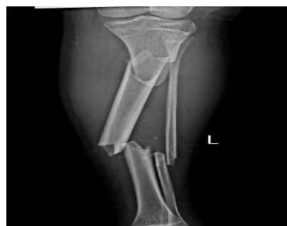
Figure 3. Preoperative anteroposterior (AP) radiograph of the tibia

We planned to start fixation from proximal to distal. Under general anesthesia and using the iliac fossa approach in the supine position, we reduced and fixed the left SIJ with plate and screws. Then, we used the Stoppa approach with the application of lateral and distal traction to the proximal femur with Schanz screw.