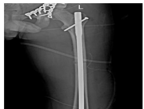
Figure 6. Postoperative anteroposterior (AP) radiograph of the femur

According to our routine follow up protocol, the patient was visited postoperatively at the intervals of 1 week, 1 month, 3 months, 6 months, and yearly thereafter.