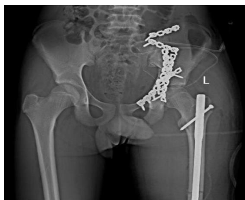
Figure 5. Postoperative anteroposterior (AP) radiograph of the pelvis

Then the patient's position was changed to lateral decubitus. By the posterior approach to the acetabulum, the posterior column was fixed with a plate and screw. In the same position with the same approach from the piriformis fossa, a femoral antegrade intramedullary nail (IMN) was inserted. After two days in the supine position, a closed IMN was inserted for the segmental fracture of the tibia (Figures 5-8).