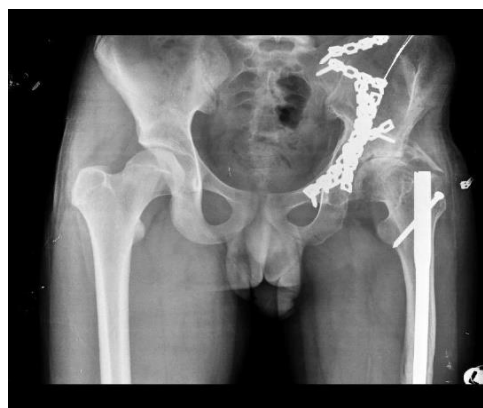
Figure 8. Pelvic anteroposterior (AP) radiographs 15 months after surgery

At the 6 th month, the union of all fractures was completed and range of motion (ROM) was full in the hip, knee, and ankle joints.