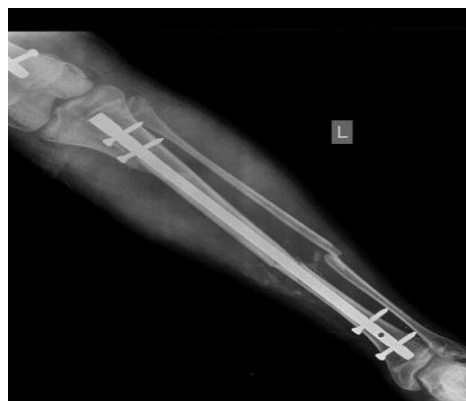
Figure 7. Postoperative anteroposterior (AP) radiograph of the tibia

At the 24 th month, post-traumatic joint degeneration in the hip joint was detected clinically and radiographically, which was scheduled for total hip arthroplasty.