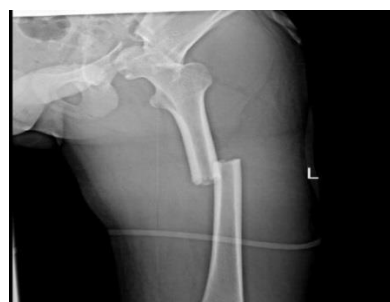
Figure 2. Preoperative anteroposterior (AP) radiograph of the femur

There were some skin abrasions over the thigh and leg (Tscherne type 1), but there was no wound. Abdomen and chest showed no problem. There was no sign or symptom of head and spine injury.