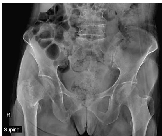
Figure 5. Case No. 3: the pelvic x-ray of the patient showing a right intertrochanteric fracture

Case 3: A 90-year-old woman was admitted to the ER with an intertrochanteric fracture due to falling (Figure 5).