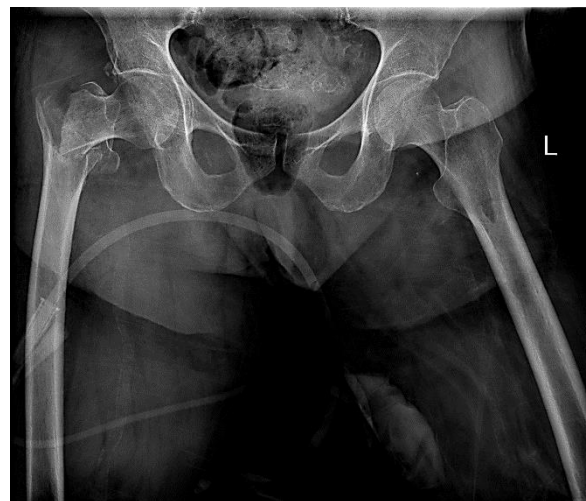
Figure 1. Case No. 1: intertrochanteric fracture in a patient with no symptoms of coronavirus disease 2019 (COVID-19)

had a history of well-controlled coronary artery disease (CAD) and diabetes mellitus (DM). Vital signs and pulmonary auscultation were normal. There was no history of respiratory distress, coughs, fever, or fatigue. On initial evaluation, we performed a pelvic x-ray and she was diagnosed with a right intertrochanteric fracture (Figure 1).