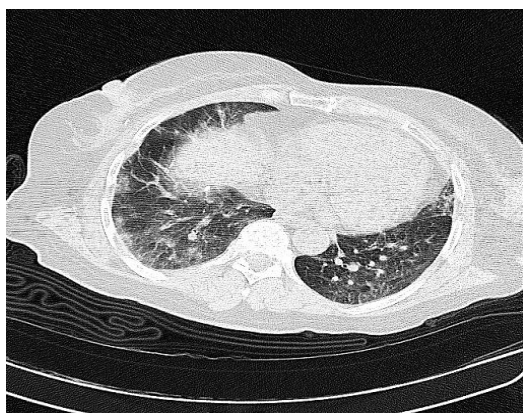
Figure 2. Case No. 1: computed tomography (CT) scan showing bilateral multi-lobar ground-glass opacities (GGOs) in the peripheral zone suggesting coronavirus disease 2019 (COVID-19)

scan to investigate lung involvement. The CT scan showed bilateral multi-lobar ground-glass opacities (GGOs) in the peripheral zone, which are highly suggestive of COVID-19 (Figure 2).