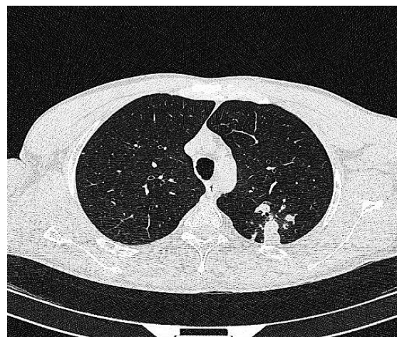
Figure 4. Case No. 2: lung computed tomography (CT) scan of the patient with clavicular fracture and incidental opacities on the chest x-ray (CXR) showing peripheral lung involvements in favor of coronavirus disease 2019 (COVID-19)

On the chest spiral CT scan, multiple peripheral multi-lobar opacities on both lungs suggested the lung involvement of COVID-19 (Figure 4). The patient was admitted to the COVID-19 quarantine ward. A nasal swab specimen for the RT-PCR test was taken which came back negative for COVID-19. Asking further questions from the patient and his family did not help to find a history of close contact with a confirmed case of COVID-19. He refused to undergo the surgical treatment for his distal clavicular fracture and was discharged with an arm sling. Based on infectious disease consultation, we decided to quarantine the patient at home with hydroxychloroquine treatment and contact precautions for his family members. Using telecommunication, we followed the patient after five days. He sustained dry coughs, low-grade fever, and malaise two days after discharge, but had no complaints of shortness of breath.