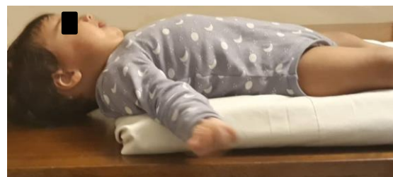
Figure 2. This picture demonstrates how to place a mattress under the child's body in case there is no special transport board to carry the multiply injured child.

A specific transport board with an occipital cutout is used to transport the child under 6 years old due to large head-to-body ratio. Using traditional transport board for young children can cause cervical cord injury because of flexion of cervical spine. We can use a mattress beneath the child body in situation that special transport board is not available (Figure 2). Immobilization of the cervical spine is necessary because every multiply injured child is supposed to have cervical spine injury (4).