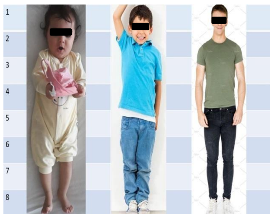
Figure 1. On average, head to body ratio in adults is about 1 to 8. On the other hands, children have relatively bigger heads, so their head to body ratio is about 1 to 4. That is one of the reasons why children are more vulnerable to head injuries.

The outcome in pediatric group is better. It is true in pulmonary contusions, head injury, wounds and fractures healing, healing of open fracture genitourinary injuries, fat embolism, and acute respiratory distress syndrome (ARDS), and deep vein thrombosis (DVT) and pulmonary thromboembolism (PTE) are rare in patients with pediatric polytrauma (2). Greater head-body ratio, less subcutaneous fat, high body surface-to-mass ratio, and less myelinated brain make children capable of intensive head injuries (Figure 1) (3).